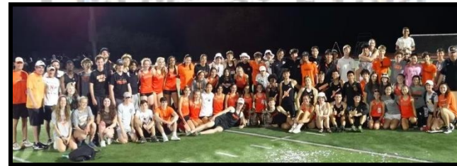
-2022 Boys and girls Regional Champs!