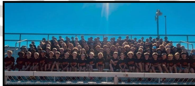
-2022 NHS Youth T&F Whole Camp Picture!