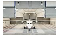
Innovation and excellence is develo... Financial Times