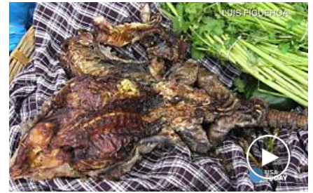
The Caribbean challenges travelers to try new foods May 29, 2014