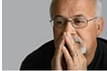
7 Symptoms of Lung Trouble Caring.com