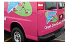
Keeping Car Wraps and Decals Looking ... FASTSIGNS