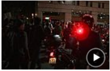
Anti-World Cup group marches in Rio May 31, 2014

Plymouth officials adopt budget, nix new fee