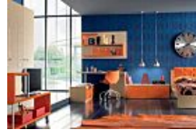
See How This Color Can Make Your Home... Decorview