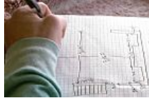
How To Avoid 4 Horrible Renovating Mistakes ulive