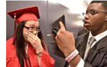
Livonia Churchill Commencement