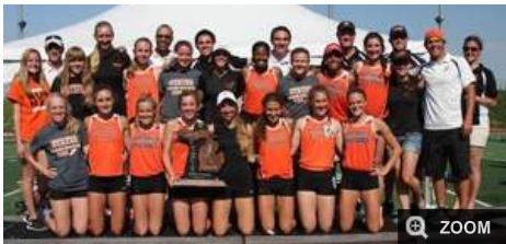
The Northville girls track and field team poses with the runner-up trophy at the Division 1 state finals.