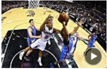
Spurs-Thunder in the wild, wild west May 31, 2014