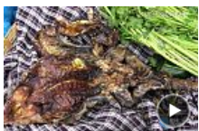
The Caribbean challenges travelers to try new foods May 29, 2014